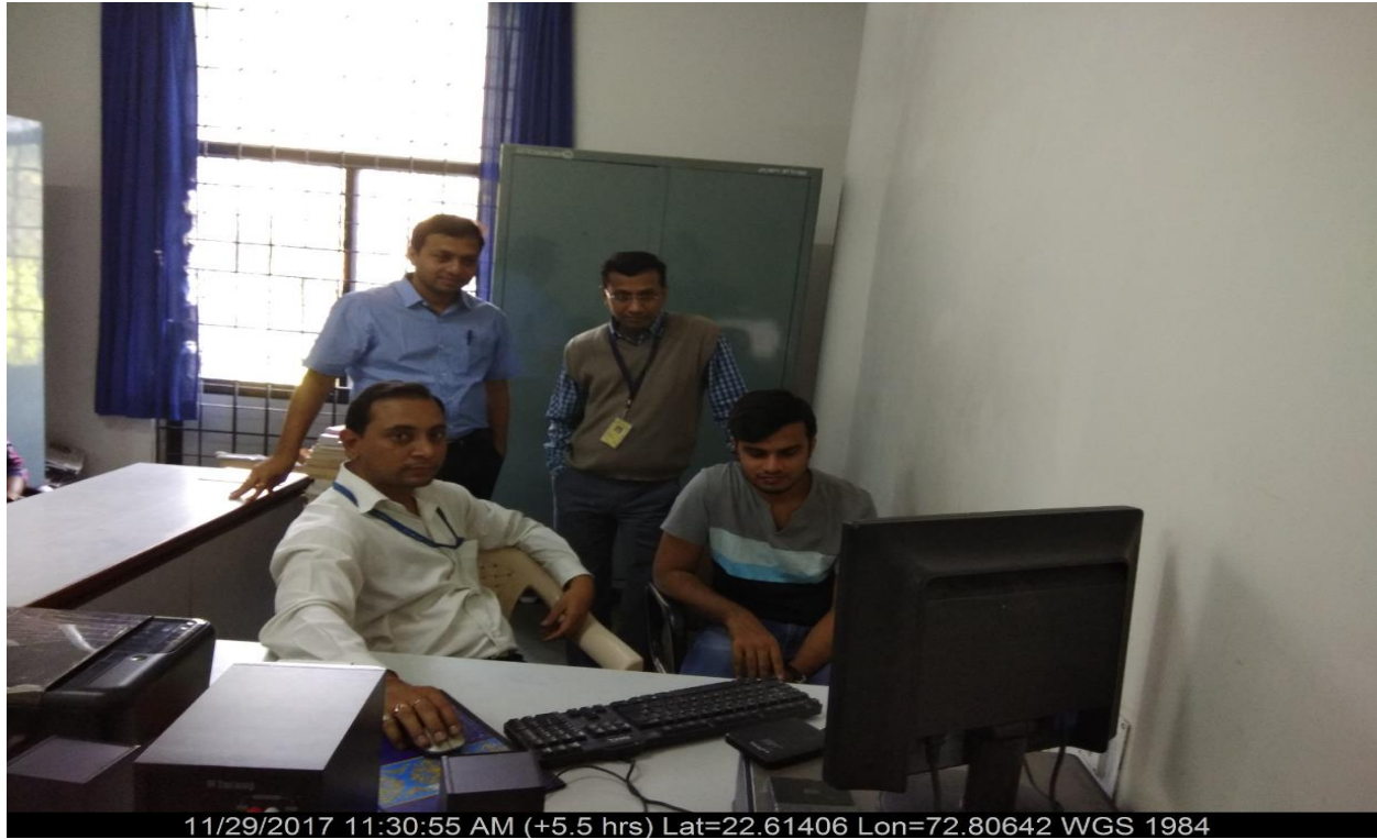
Knowledge Resources Centre, CHARUSAT on 29 th November, 2017