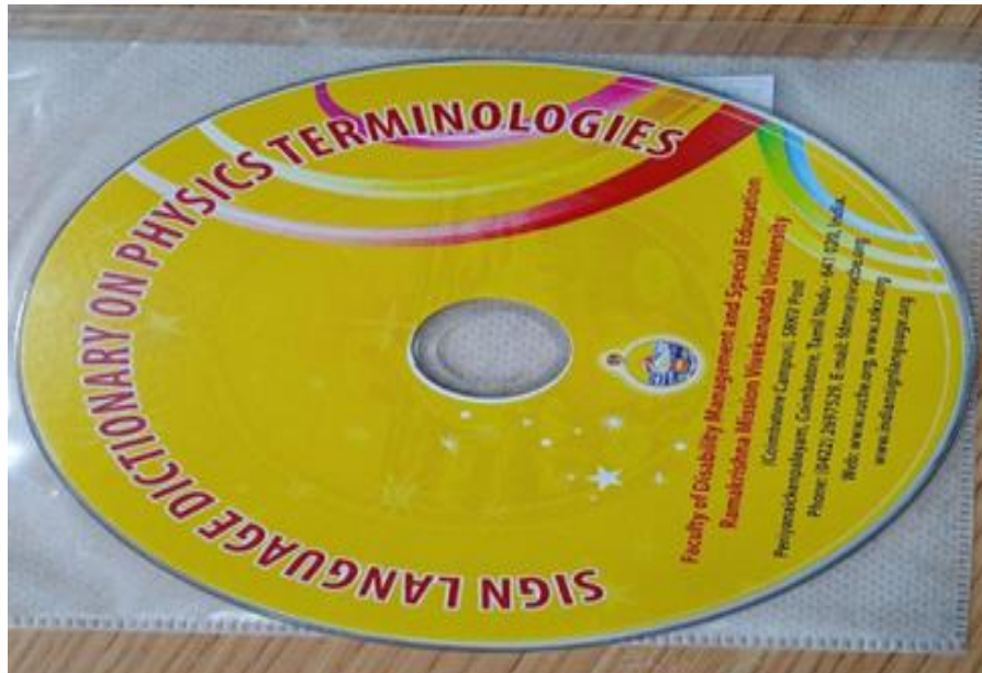
Audio CD: Sign Language Dictionary on Physics Terminologies