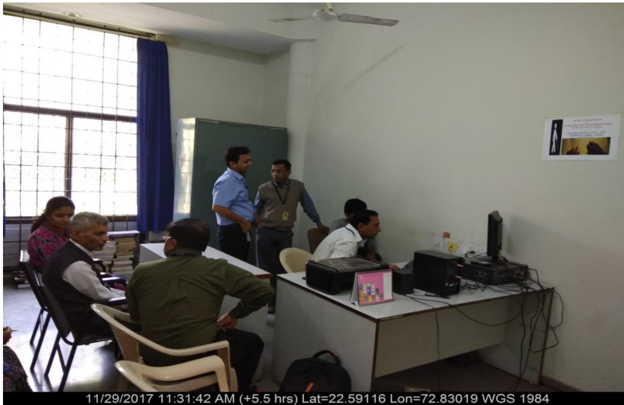
Knowledge Resources Centre, CHARUSAT on 29 th November, 2017